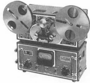
model X-400-E-1 (16mm)

every recorder is a complete sound system!