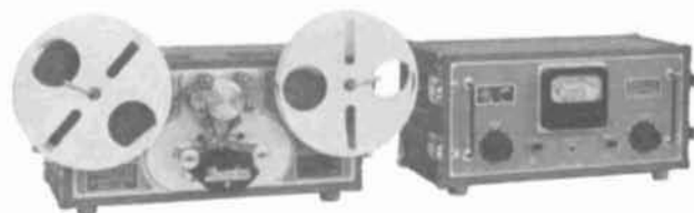
the X-400 from $985.00

INTERNATIONAL LEADERS IN THE DESIGN AND MANUFACTURE OF QUALITY MAGNETIC FILM RECORDING DEVICES