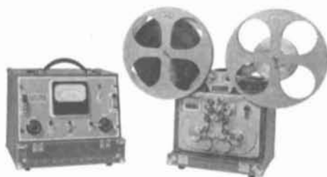
the TYPE 1 from $1360.00