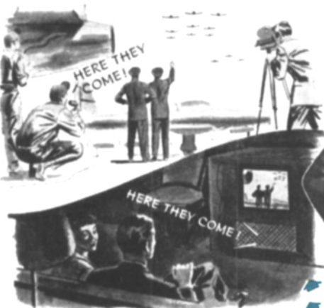
"FILMAGNETIC" SOUND FOR COLOR OR BLACK & WHITE

"Filmagnetic" 3 Input Amplifier, Model MA-10, with High-Fidelity Microphone, complete Cables and Batteries, in a Cowhide-Leather Carrying Case. Super-portable, weighs only 7 pounds, carries easily with shoulder-strap during operation!