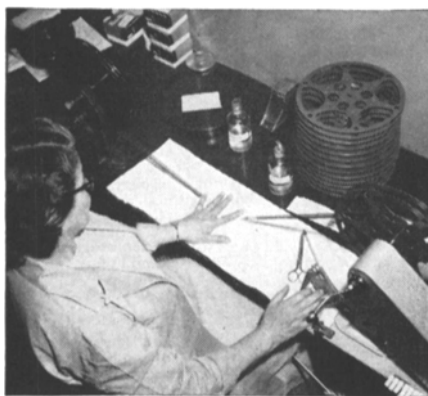
• Hand cleaning of film is safer with new "Freon"-TF solvent. It is nontoxic and odorless... does not cause nausea or headaches.