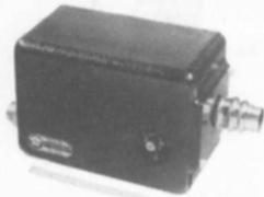
200 foot capacity