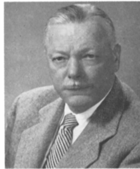
JOSEPH E. AIKEN Governor, 1958-59