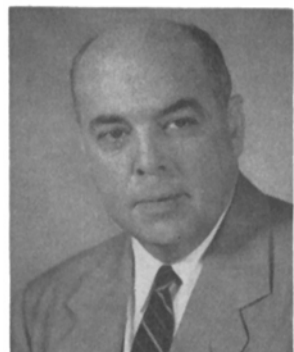
JEROME C. DIEBOLD Governor 1959