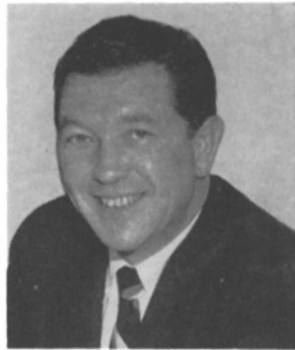
THEODORE B. GRENIER Governor, 1959-60