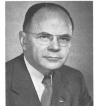
DEANE R. WHITE Governor, 1958-59