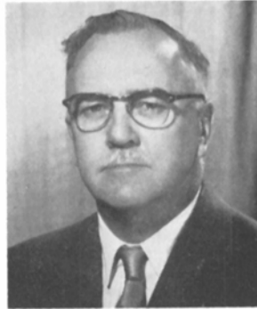
UB IWERKS Governor, 1959-60