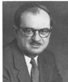
W. W. WETZEL Governor, 1958-59