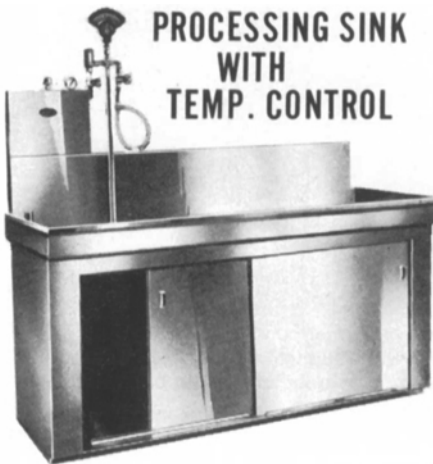
PROCESSING SINK WITH TEMP. CONTROL

The Fisher line includes processing machines, processing sinks, tanks and trays, controls, regulators, mixers, washers, dryers and many other products that help to make photo processing a better more efficient industry.