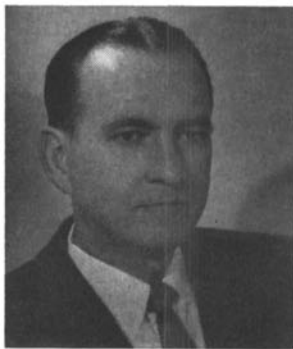
MALCOLM G. TOWNSLEY Governor 1960-61