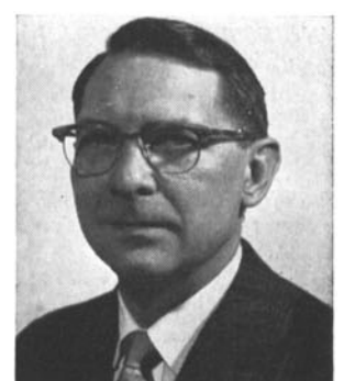
WILLIAM H. SMITH Governor 1961