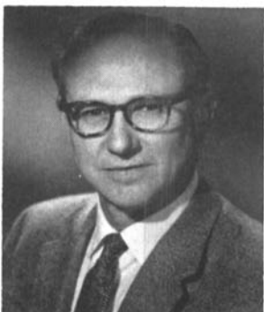
RALPH E. LOWELL Governor 1961