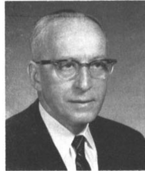
WALTER I. KISNER Governor 1961-62