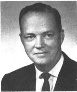
JAMES W. BOSTWICK Governor 1961-62