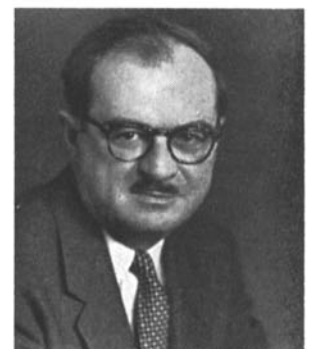
W. W. WETZEL Governor 1960-61