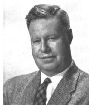
RODGER J. ROSS Governor 1961-62