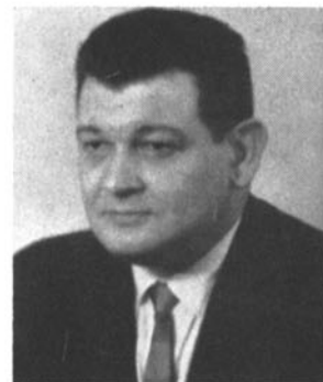
JAMES W. KAYLOR Governor 1961