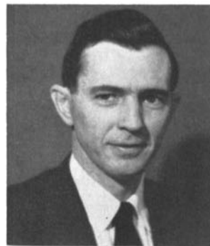
CHARLES W. WYCKOFF Governor 1960-61