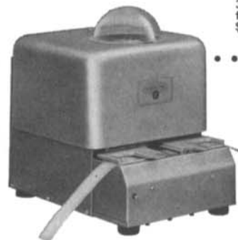
Unicorn 35 mm Automatic Film Splicer. Two other standard models available for 16 and 70 mm film stock. Price: (35 mm model) $2200.00, f.o.b. Sylmar, California.