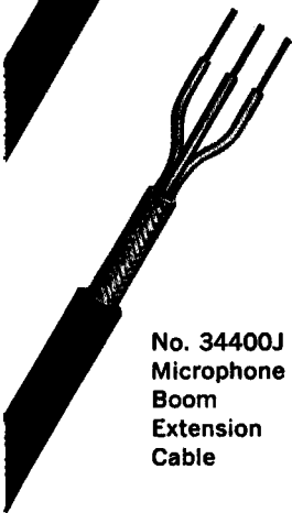
No. 34400J Microphone Boom Extension Cable

SPECIAL QUALITIES needed for efficiency and dependability that are found in these cables: