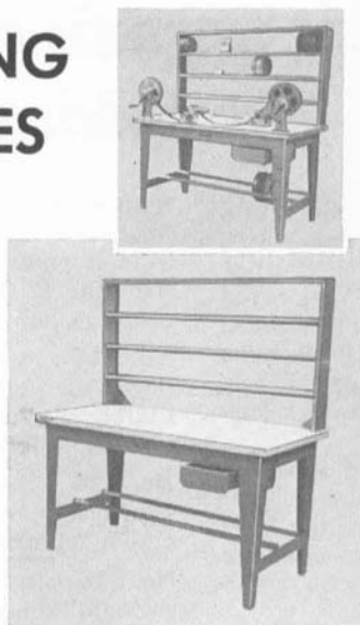
Table Only (without light box, drawer and rack) $80.00