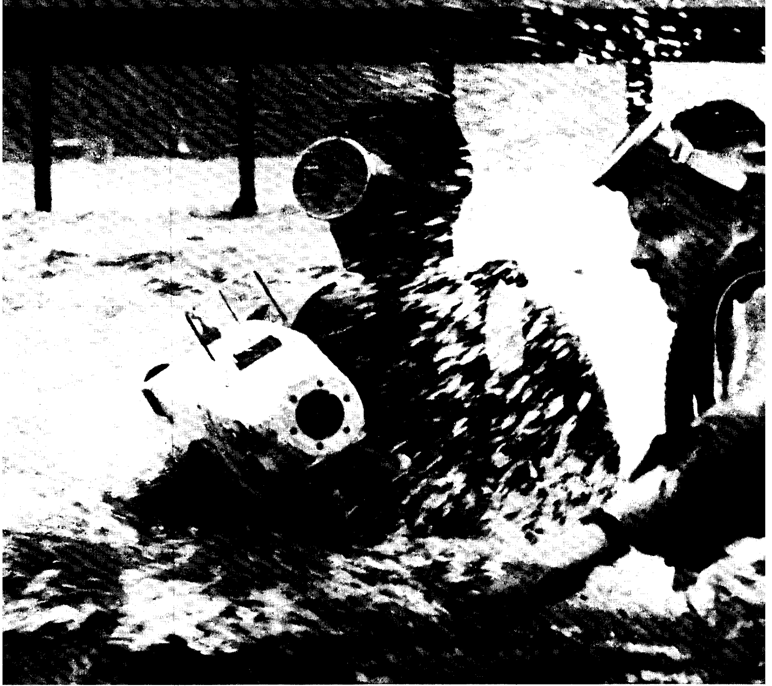
Point Mugu, California