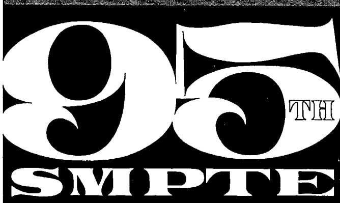
EXHIBIT OPEN APRIL 13-16, 1964