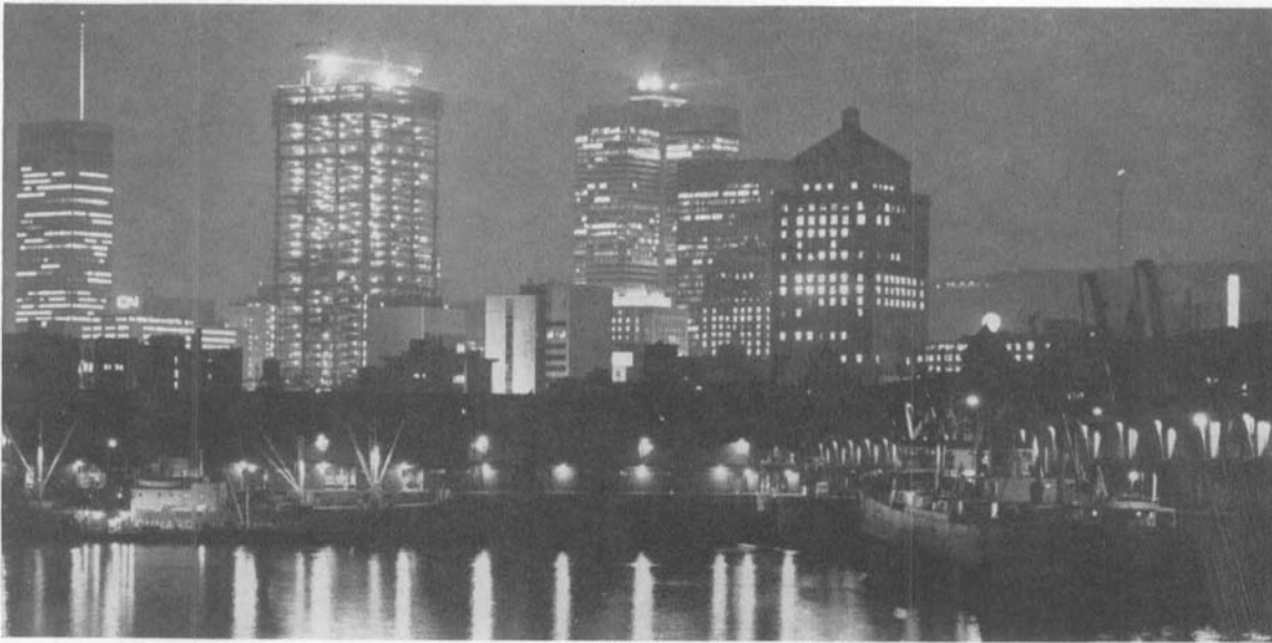
Montreal, here shown at night, is the site of the 98th semiannual SMPTE Technical Conference and Equipment Exhibit. Montreal, next to Paris, is the largest French-speaking city in the world.