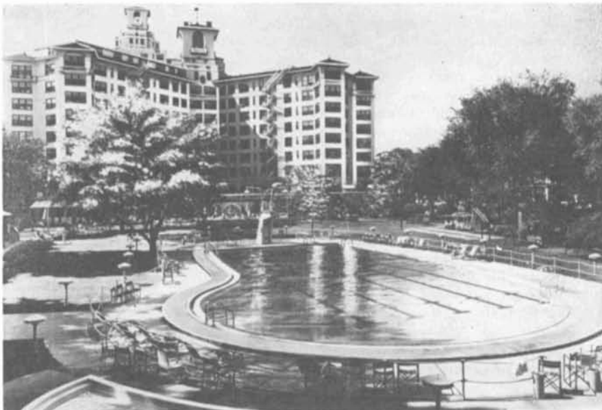
Edgewater Beach Hotel — Site of the 102nd Conference

Due to the early Journal publication in relation to the Conference date, the Advance Program on the following pages is tentative and should not be considered final. There will probably be changes before the Final Program brochure is published just prior to the Conference; indeed there will no doubt be many additional papers to be fitted in well after this is published. Those who can attend only a portion of the sessions are urged to telephone one of the numbers given in the introduction to the Advance Program on the following page, to find out when a specific paper is to be given.