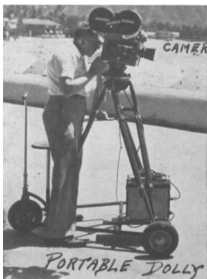
Fig. 1. Portable camera dolly, Honolulu, T.H., March 1936.