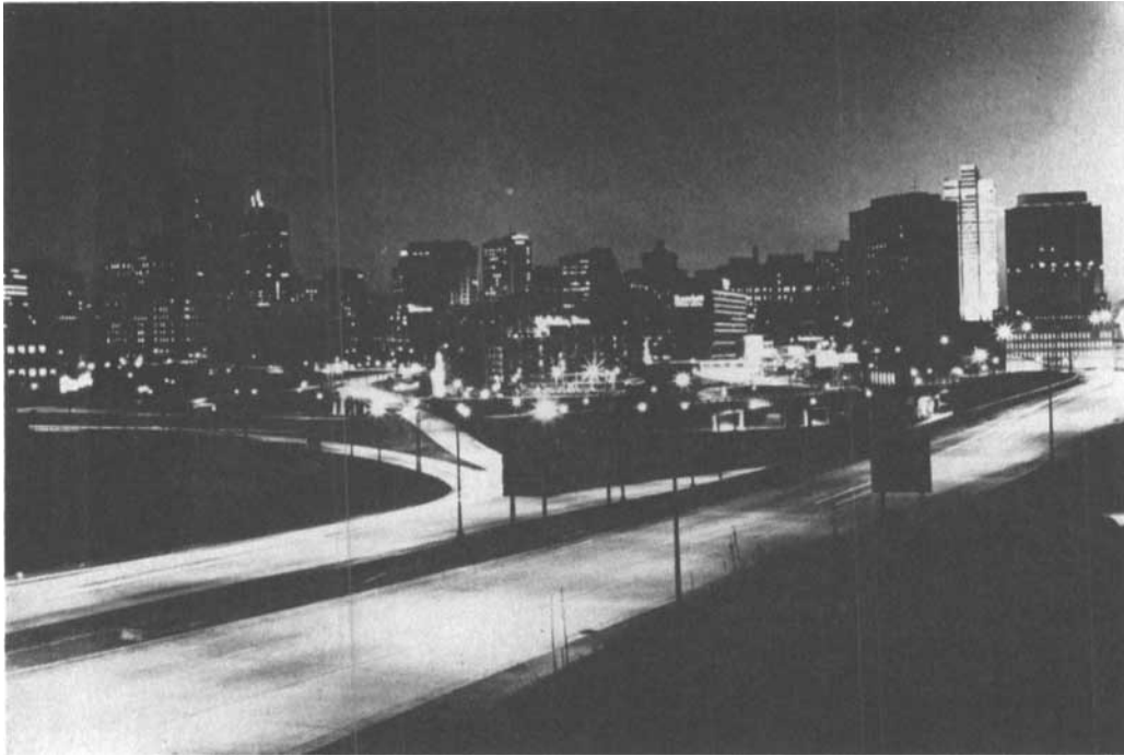
Downtown Atlanta by night.