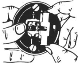
S-3972-N1 Shuttle Teeth Gauge

This pair of precision tools cuts hours off Filmo repair time. Regular price for this set is $341.62. We offer these—in brand new condition—while they last—both gauges $150