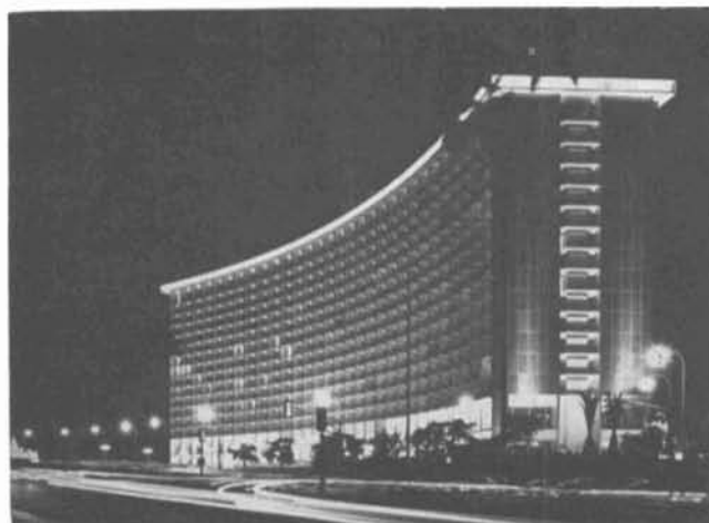
Night time scene of the Century Plaza Hotel, site of the 106th SMPTE Conference.