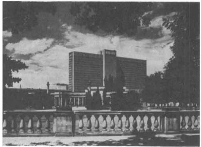
The Denver Hilton Hotel as seen from the Civic Center in downtown Denver.

A number of activities have already been planned for the Congress. Registration will begin on Saturday, August 1, and continue on Sunday. The Equipment Ex-