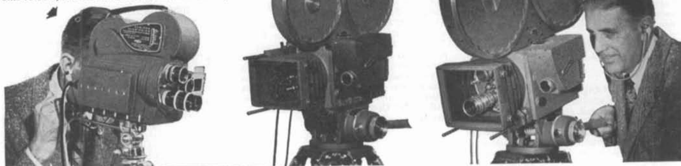
CINE-VOICE II, takes 100 ft. Runs 2¼ min. $1180.00 & up