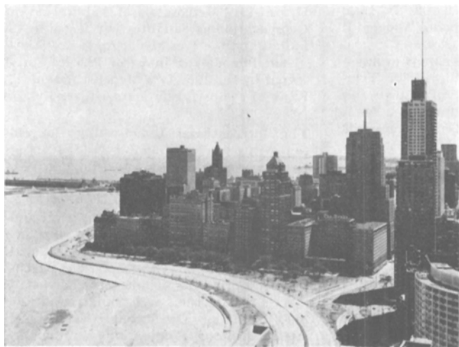
The Drake Hotel