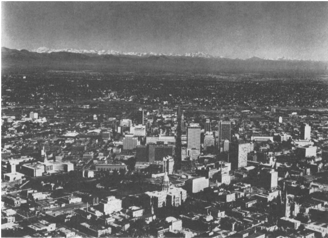
Denver Aerial — The snow-capped Rockies form a spectacular backdrop for the shining new skyscrapers of downtown Denver. At far left is the Queen City's classic Civic Center. In the center foreground is the gold-domed State Capitol Building, modeled after the US Capitol in Washington, DC. The thirteenth step of the west side of the Capitol is exactly one mile (5,280 ft) above sea level. Denver's tallest buildings are Brooks Towers, 42-stories, in the background at left center, and the 31-story Security Life Building at right center.

9TH INTERNATIONAL CONGRESS ON HIGH-SPEED PHOTOGRAPHY