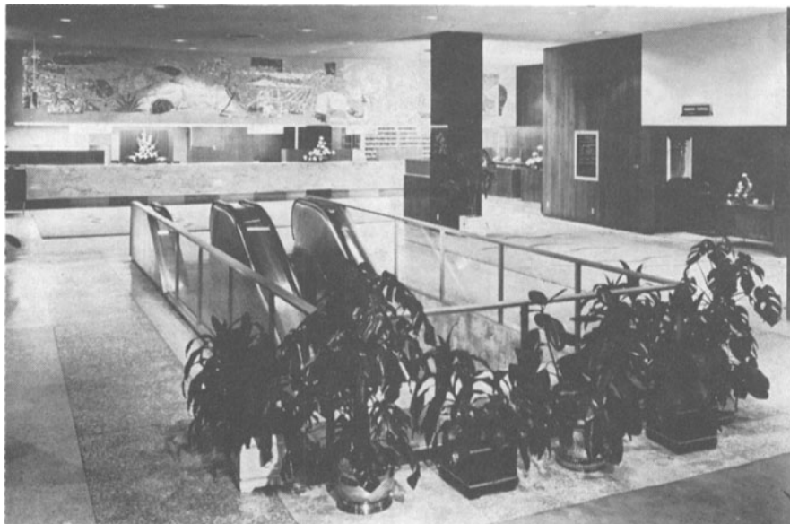
Lobby of the Sheraton-Dallas.