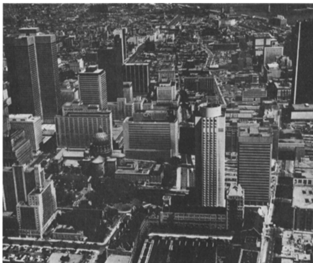
The City of Montreal