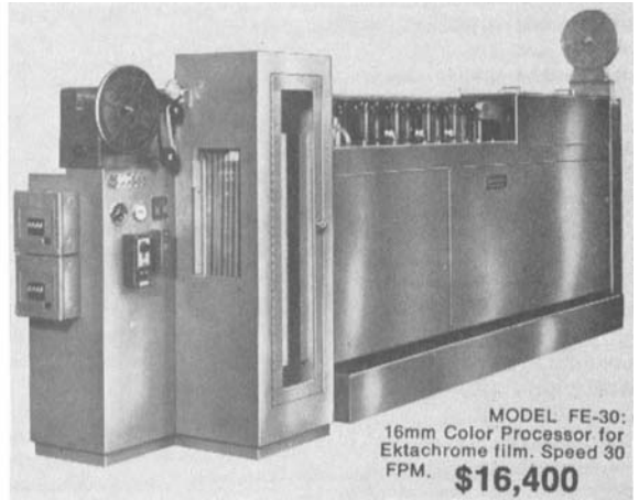
MODEL FE-30: 16mm Color Processor for Ektachrome film. Speed 30 FPM. $16,400