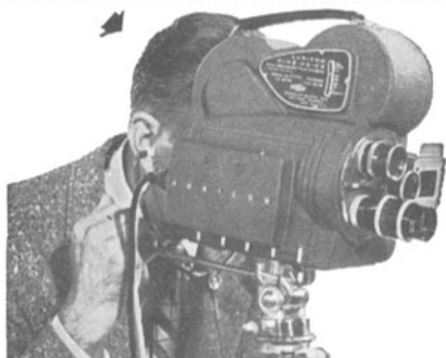
CINE-VOICE II, takes 100 ft. Runs 2¼ min. $1180.00 & up