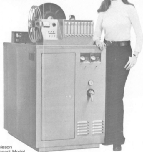
Jamieson Compact Model

A large selection of models...color and B&W film for 8mm, 16mm and 35mm film, ME4, ME/ECO3, Color, Color Neg. II, B&W Reversal, B&W neg./positive and B&W negative.