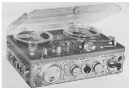
4.2L SYNCHRONOUS 1/4" TAPE RECORDER