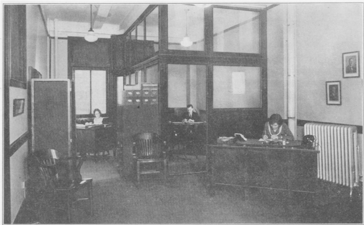
The General Office, 33 West 42nd St., New York, N. Y.