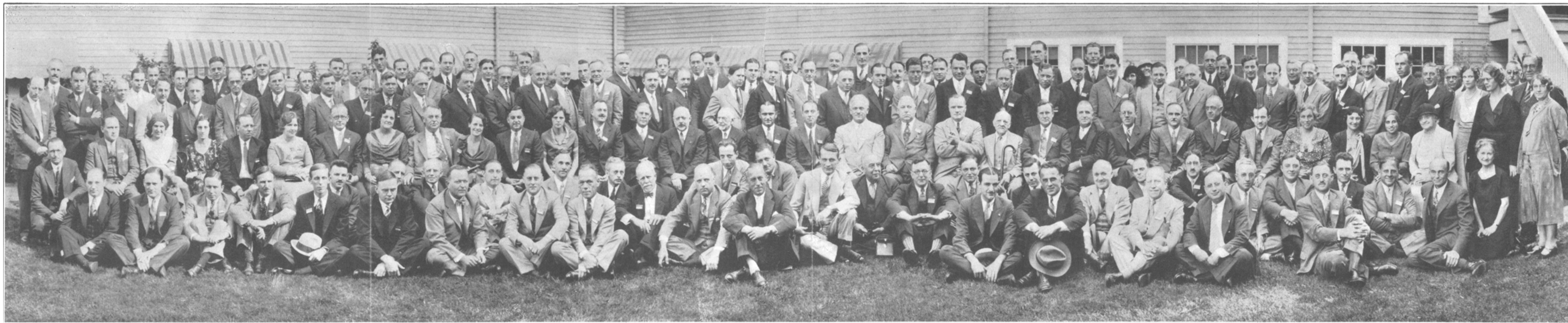
FALL MEETING SOCIETY OF MOTION PICTURE ENGINEERS NEW OCEAN HOUSE SWAMPSCOTT, MASS., OCTOBER 5 8, 1931.