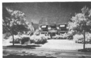
INFRA D F FILTER