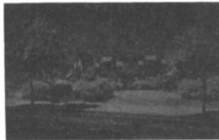
INFRA D F FILTER POINTED FOR NIGHT EFFECT