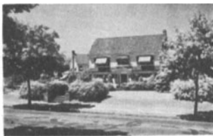
INFRA D K 5 FILTER