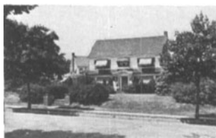
INFRA D NO FILTER