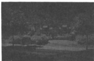
INFRA D F FILTER POINTED FOR NIGHT EFFECT