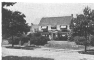
INFRA D NO FILTER