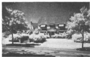
INFRA D F FILTER