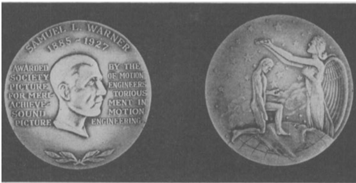
SAMUEL L. WARNER MEMORIAL AWARD PRESENTED ANNUALLY FOR MOST OUTSTANDING WORK IN SOUND MOTION PICTURE ENGINEERING

These regulations, a list of those who previously have received the Award, and a statement of the reason for the Award shall be published annually in the April issue of the JOURNAL of the Society.