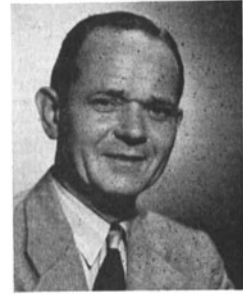
CHARLES R. DAILY Governor, 1950