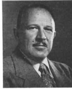
GEORGE W. COLBURN Governor, 1950