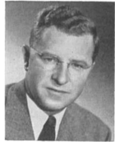
WILLIAM B. LODGE Governor, 1950