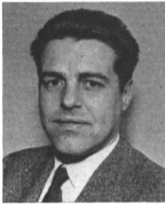
EDWARD SCHMIDT Governor, 1950