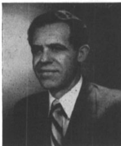
LORIN D. GRIGNON Governor, 1950-51