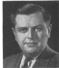
WILLIAM H. RIVERS Governor, 1950-51