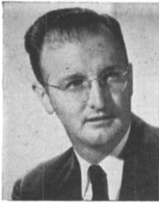
NORWOOD L. SIMMONS Governor, 1949-50