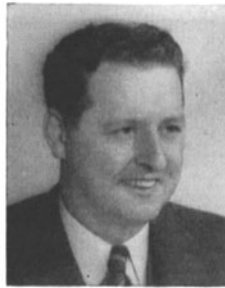
HERBERT BARNETT Governor, 1949-50