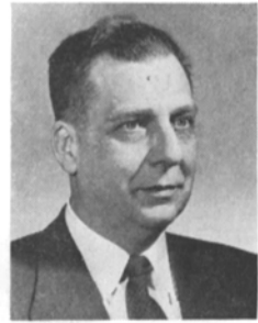
FRANK E. CARLSON Governor, 1951-52