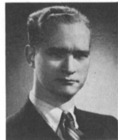
ELLIS W. D'ARCY Governor, 1952-53