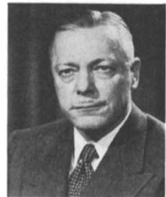
JOSEPH E. AIKEN Governor, 1952-53