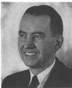
MALCOLM G. TOWNSLEY Governor, 1951-52