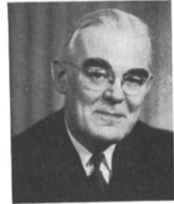
AXEL G. JENSEN Governor, 1952-53