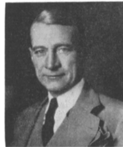
OSCAR F. NEU Governor, 1951-52