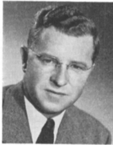
WILLIAM B. LODGE Governor, 1951-52