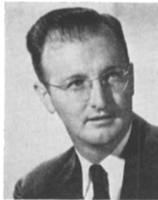
NORWOOD L. SIMMONS Governor, 1951-52