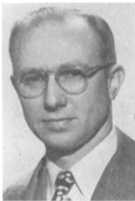
RALPH E. LOVELL Governor, 1954-55