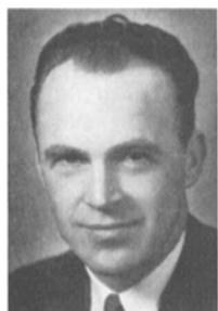
PHILIP G. CALDWELL Governor, 1954