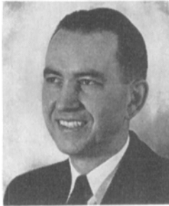
MALCOLM G. TOWNSLEY Governor, 1953-54