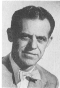
LORIN D. GRIGNON Governor, 1954-55