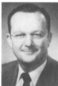
EVERETT MILLER Governor, 1954