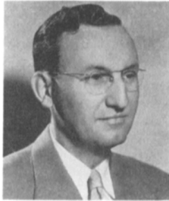
CHARLES L. TOWNSEND Governor, 1953-54