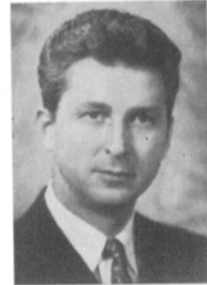
FRANK N. GILLETTE Governor, 1954-55