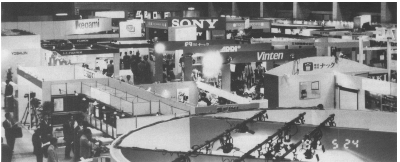
The 23rd Exhibition of the MPTEJ.