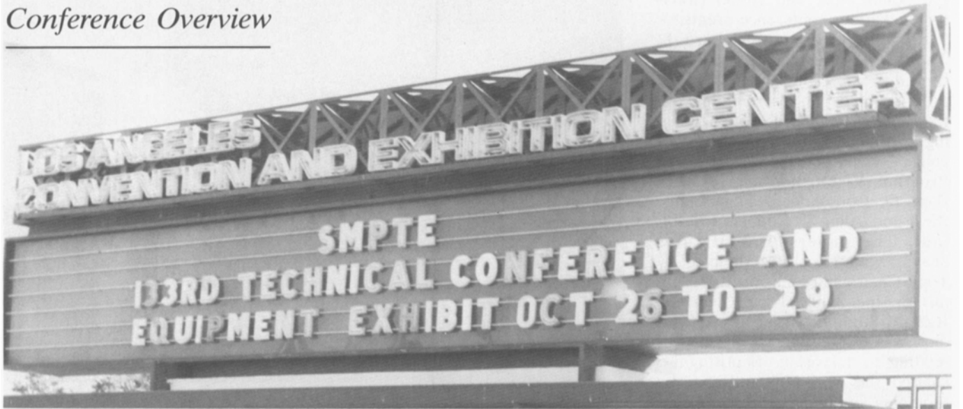
The marquee of the Los Angeles Convention Center featured the SMPTE Conference.