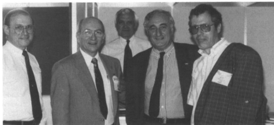
The SMPTE Booth at IBC was a hub of activity. During the conference 30 new members were welcomed into the Society.