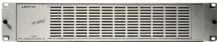
FR-6802 Serial DA Frame

As the manufacturer of Digital Glue,™ Leitch has a pedigree second to none. Working closely with the world's most demanding broadcasters and production facilities, Leitch engineers have provided the digital solutions. The wide range of serial digital 'glue' products gives unsurpassed integration, flexibility, performance and outstanding value. If you are planning a digital installation, call to find out how Digital Glue™ can work for you. Leitch innovative designs are engineered to put together exactly what you need for today's system requirements – and package them into our flexible, expandable frame system.