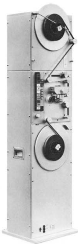
MB 51-16/35 THE SOUND FOLLOWER THE 6-TRACK MASTER RECORDER

The choice of the leading studios in the world of film