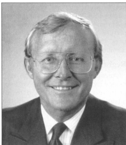
Keynote Speaker James H. Clark