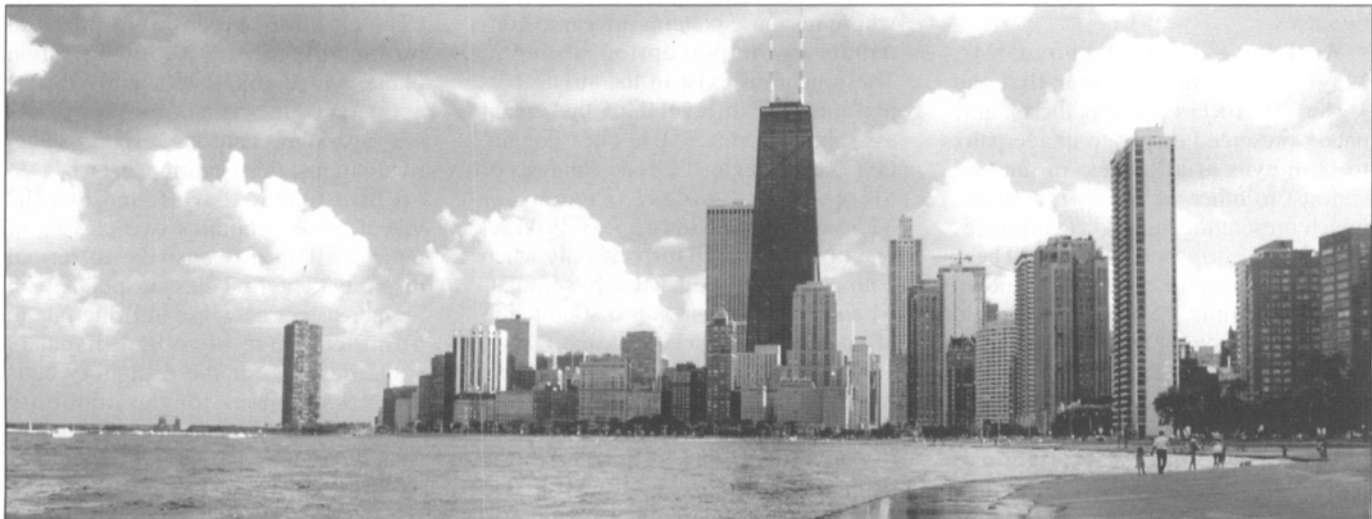
The Chicago skyline.