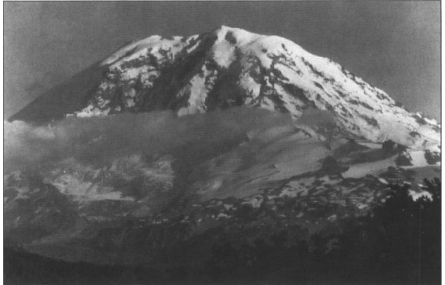
The majesty of Mount Rainier is one of the first things to greet visitors to Seattle upon approach to the Seattle-Tacoma International Airport.