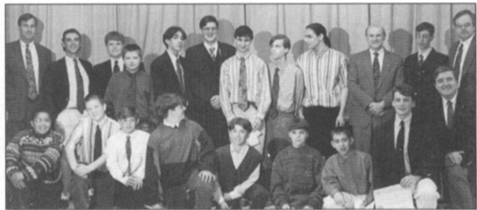
New members of the Mashpee Student Chapter pose with SMPTE officers.