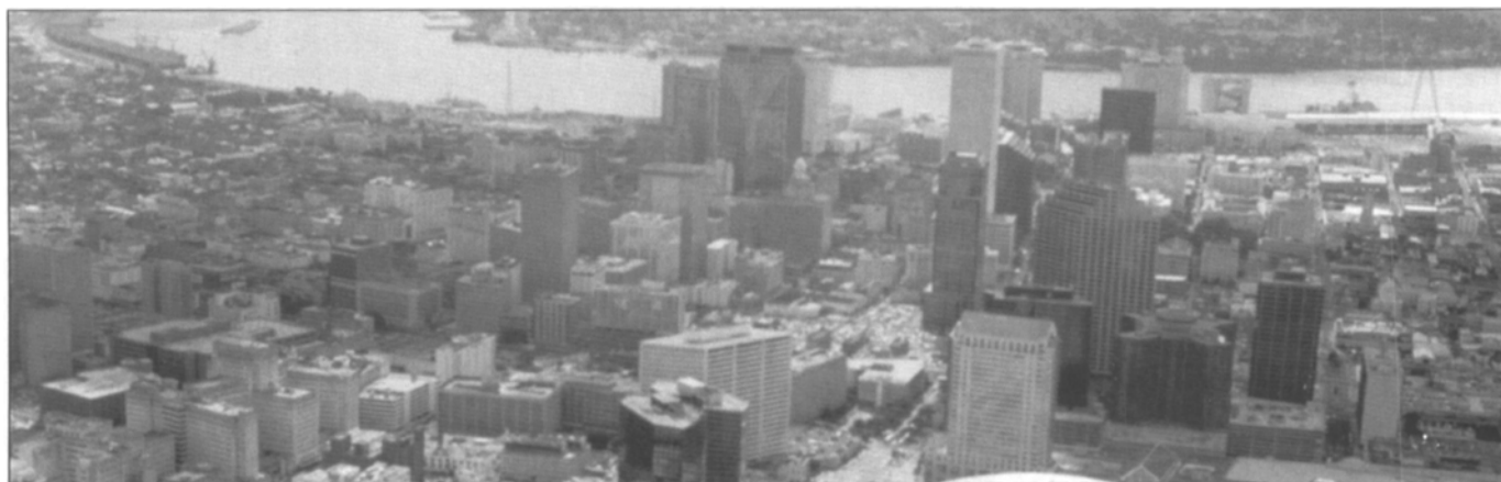
Aerial view of Los Angeles.