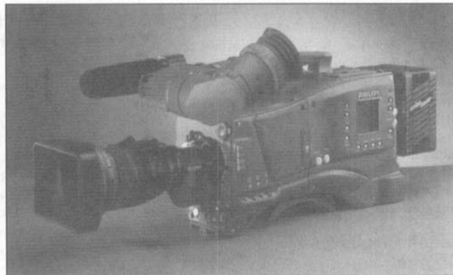
The LDK 120 Camera