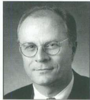
Governor-at-Large Charles L. Dages