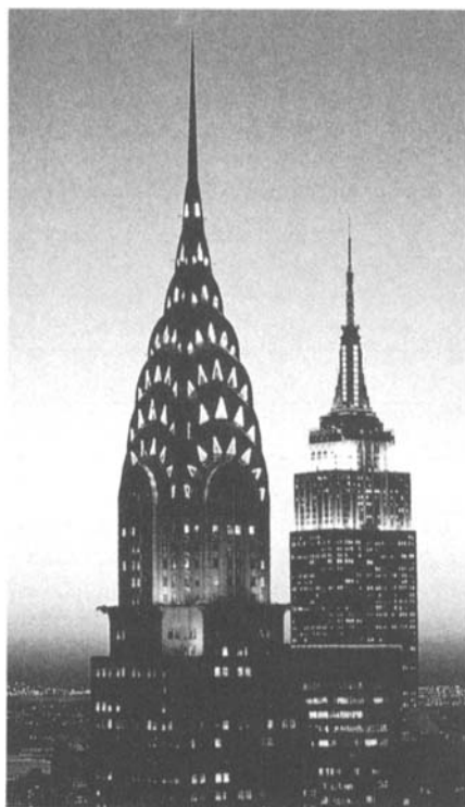
SMPTE Journal, July 1999