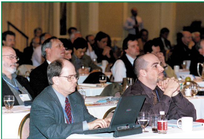
Attendees listen intently during one of the informative sessions of the 35th Advanced Motion Imaging Conference.

Communications Engineering, Inc. Geocast Network Systems iBlast Leitch, Inc. Liberty Livewire Logic Innovations Omneon Video Networks Panasonic Rohde & Schwarz Sony Tektronix, Inc. Thomcast Triveni Digital WHD-TV