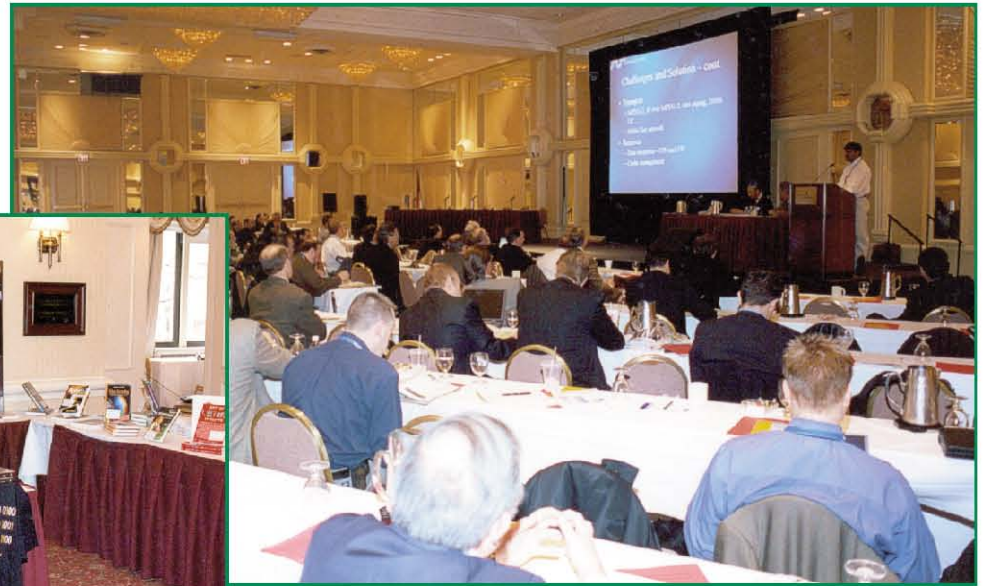
The Capital Hilton's Presidential Ballroom was the perfect venue for three days of intense sessions.