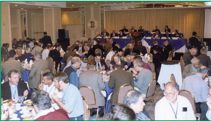
The Get-Together Luncheon gave everyone a chance to sit down and discuss what they had been learning at the sessions, and afforded attendees a chance to network with peers.