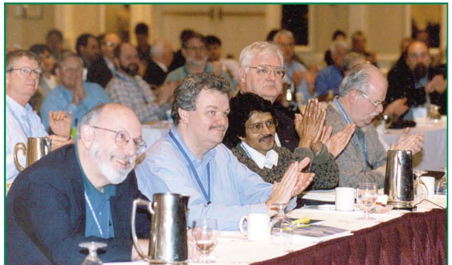
Attendees applaud speakers after one of the conference's many informative sessions.