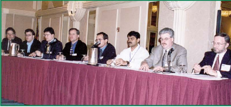
One of the many panel discussions that ended each session. Question and answer periods always strengthen the sessions by amalgamating the talents of those who presented papers into one body.