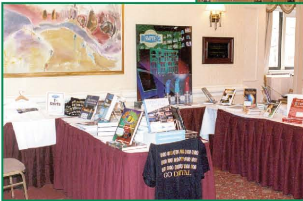
The SMPTE Bookstore—open and ready for business.