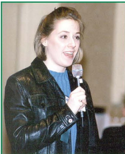
A Conference Assistant rephrases a question posed to a panel member.