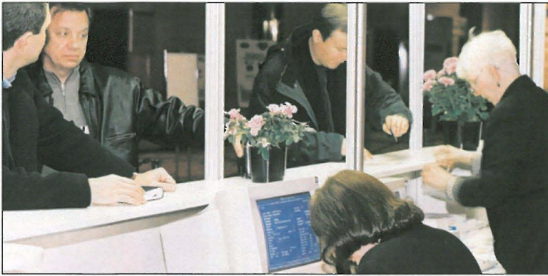
It was smooth sailing at the registration booths, as attendees grabbed their conference materials and passes, and headed for the sessions and exhibit halls.