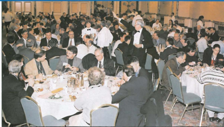
Attendees of the Industry Luncheon enjoy fine dining in the Hilton New York's elegant Trianon Ballroom.