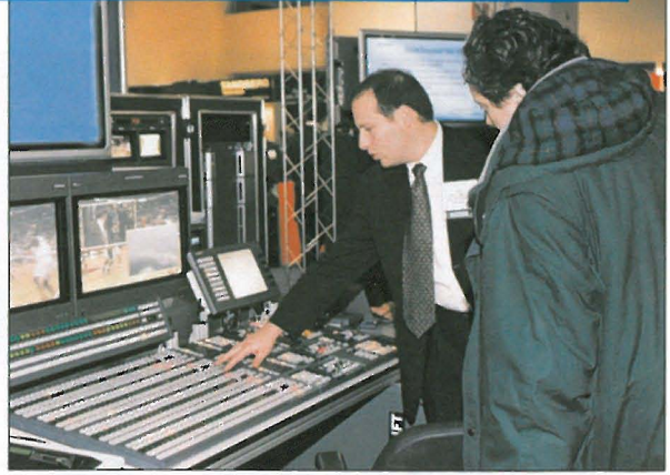
An exhibitor shows his wares in one of the two exhibit halls. Seventy exhibitors displayed the latest in motion imaging products, services, and technology.