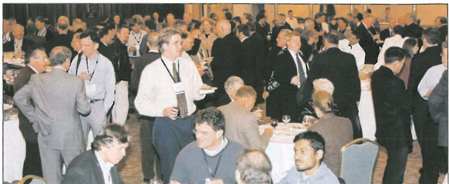
The Welcome Reception, given for all attendees and exhibitors, is well under way in the elegant Trianon Ballroom of the Hilton New York.

Monday's morning sessions adjourned in time for attendees to get to the Industry Luncheon, held in the Hilton New York's elegant Trianon Ballroom. This annual event brings SMPTE Conference attendees together at a formal luncheon where they can meet colleagues and associates, and hear addresses by the industry's movers