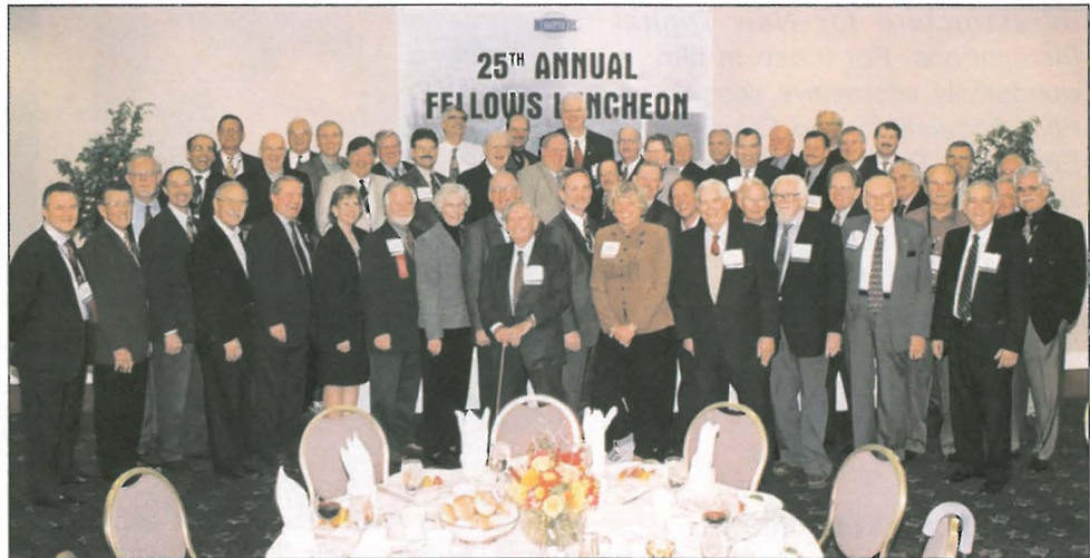
Attendees of the 25th Annual Fellows Luncheon. SMPTE welcomed 12 new Fellows at the function.